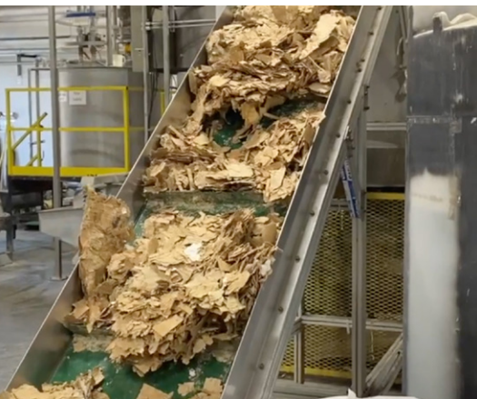
SORTED PAPER WASTE ENTERING PULPER