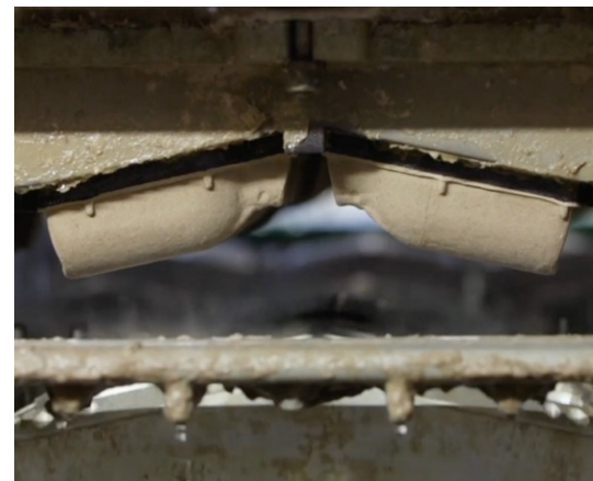
PULP TRANSFORMED INTO DESIRED SHAPE

For additional information, visit ecologicbrands.com