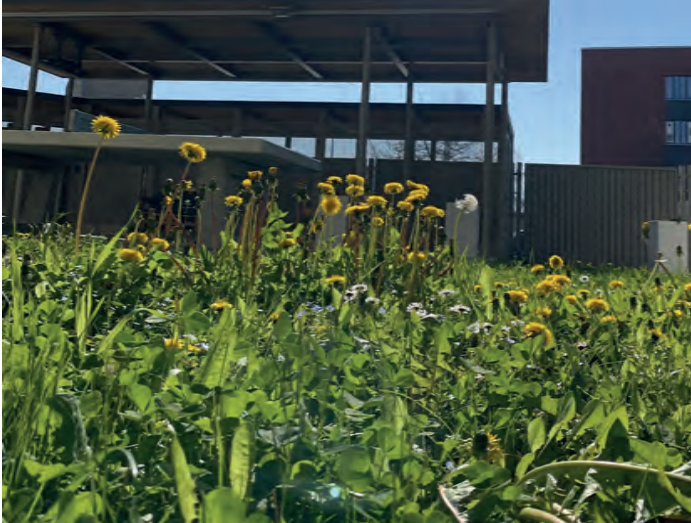
Outdoor Test Set Up with Sun Facing Targets & Camera