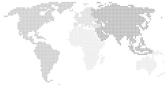
PURCHASED WATER BASELINE CONSUMPTION (CALENDAR YEAR DATA IN CUBIC METERS)

In 2014, we purchased nearly 7 million cubic meters of water across our operations in the Americas, Asia and Europe. The volume increase from previous years can be attributed to reporting water data from more sites in 2014 and the acquisition of Nypro.