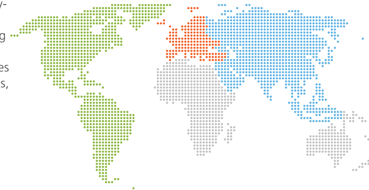
GLOBAL EMPLOYEES BY LABOR CATEGORY