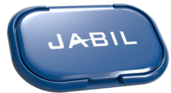
IN MOLD LABELING