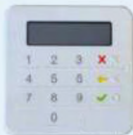
POS Terminal White Label