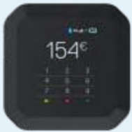
POS Terminal By YouTransactor