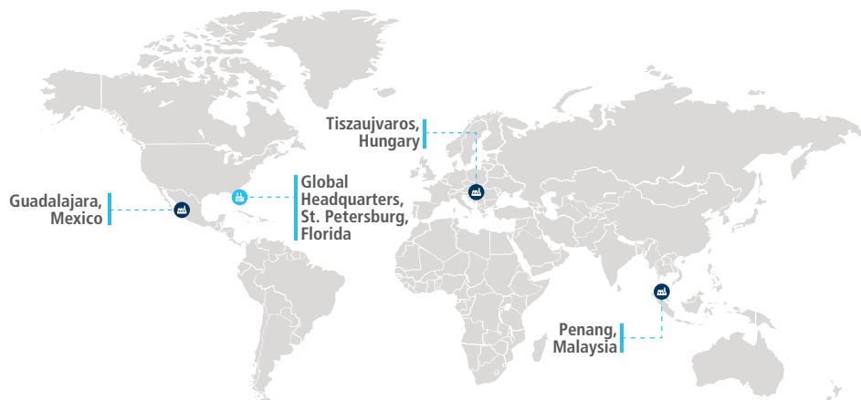
Jabil's four centralized regional procurement centers are deployed globally and interface with over 27,000 established local and global suppliers